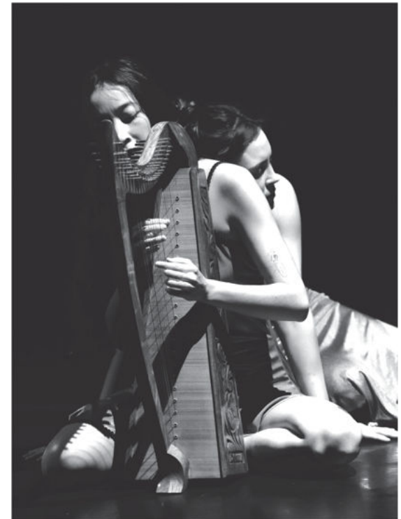
Festival'22 Artists